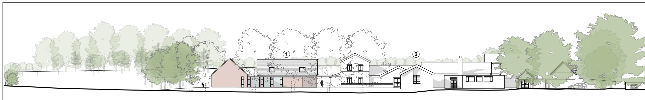
Proposed North Elevation (showing proposed classroom extension)

Not to Scale P11628 - A.100_Rev B July 2018