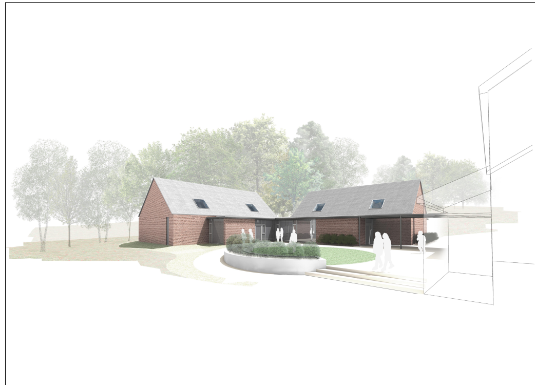
Proposed Classroom Extension and Landscaped Courtyard